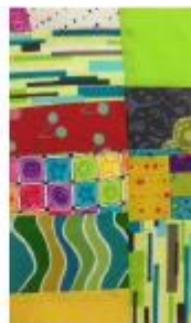
....beautiful Improvisational Blocks like these to put into a modern quilt layout!