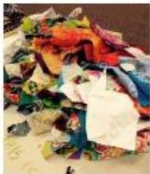
From a pile of scraps to.....