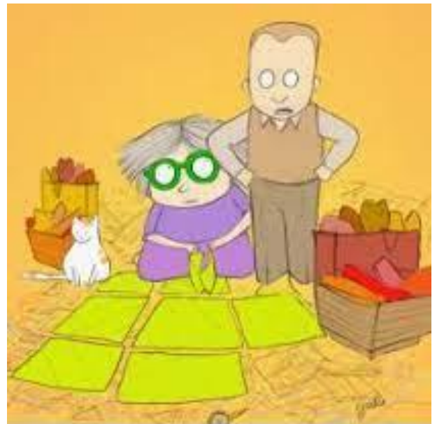
"Laying out a quilt top over the mess doesn't count as spring cleaning."